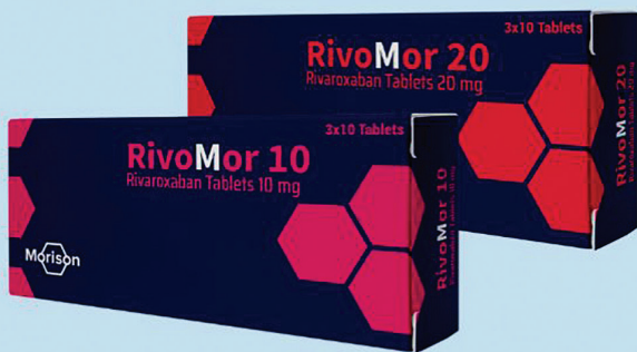
Rivaroxaban 10 mg & 20 mg