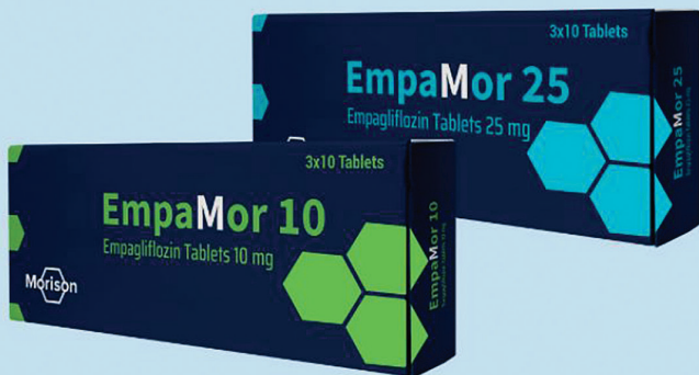
Empagliflozin 10 mg & 25 mg