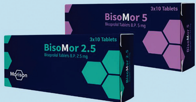
Bisoprolol 2.5 mg & 5 mg