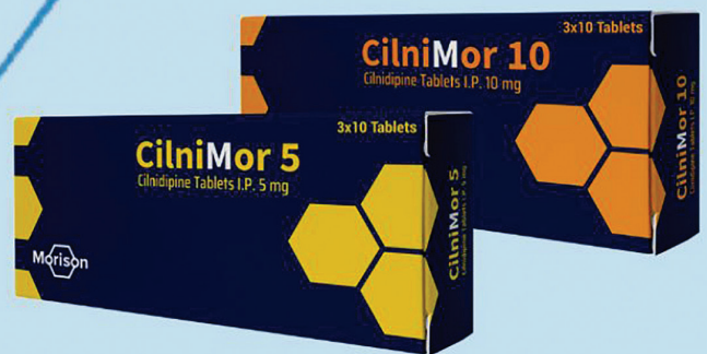
Cilnidipine 5 mg & 10 mg