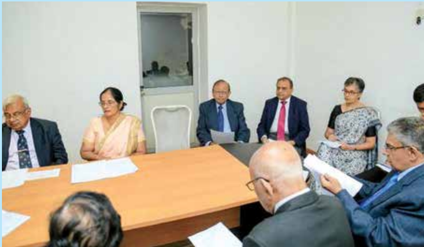
Captures from the Council meeting held on Sunday the 27 th of October at Ninewells Hospital.